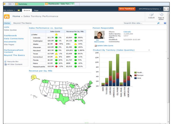
Data visualization for better business decisions

Enabling users to address specific business and collaboration needs, while relieving it from the need to be involved in each and every change to the platform, is made possible through a rich set of tools and features that allow users to create no-code solutions and to deploy those solutions in an easy and secure manner.